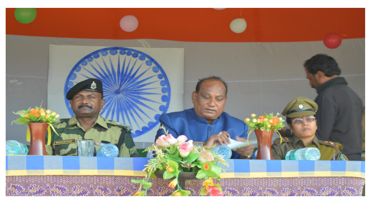
Guest of Honor BSF Commandant 149 Bn in NCC Day

Cadets shows Sambalpuri Dance on the Occasion of NCC Day