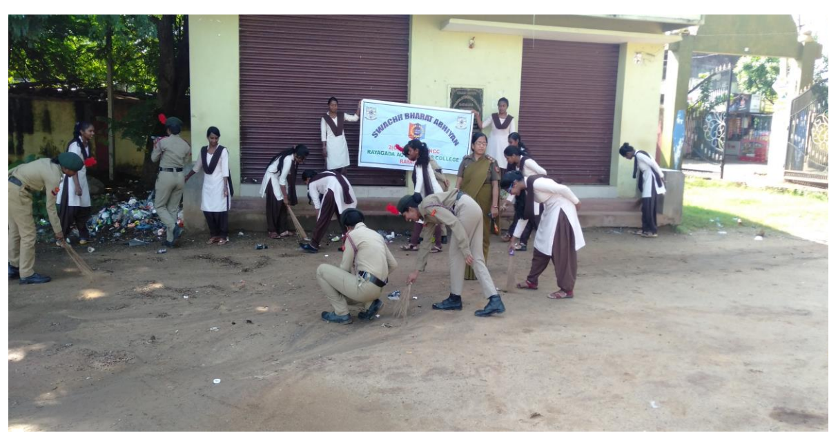
CLEAN INDIA GREEN INDIA