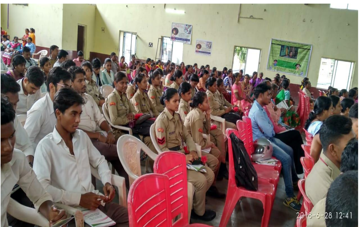
LEGAL AWARENESS PROGRAMME