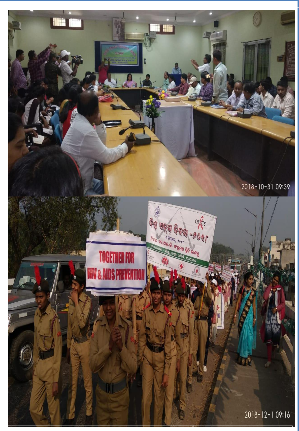
MASS AWERNESS AIDS RALLY