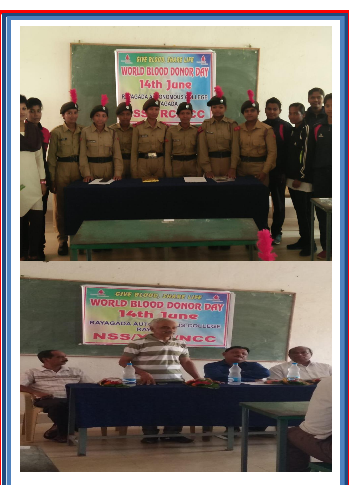
WORLD BLOOD DONOR DAY