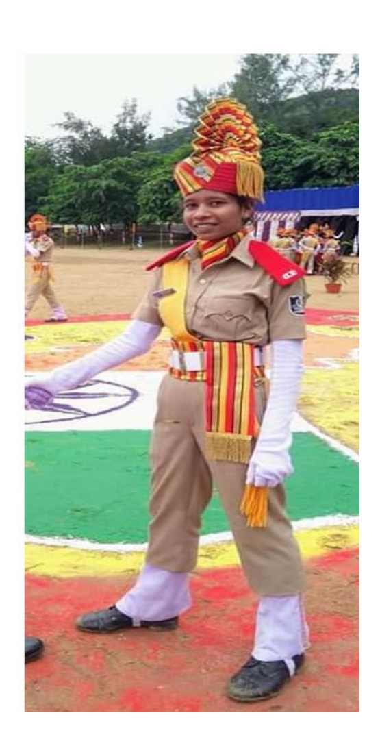
JUO. BASANTI PIRBAKA JOINED IN ODISHA POLICE