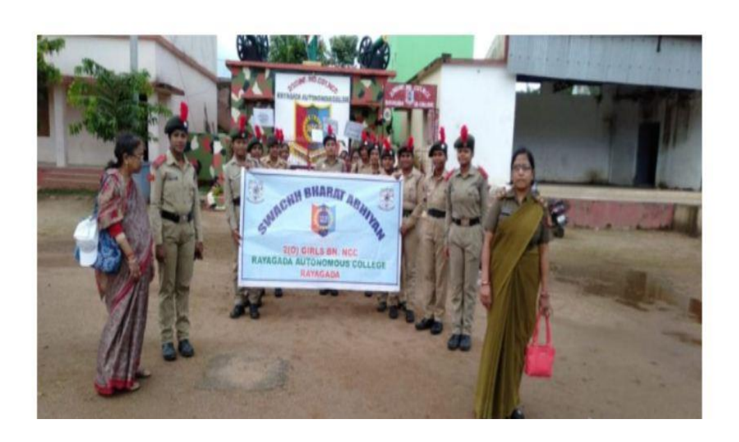
POLLUTION FREE CAMPAINING