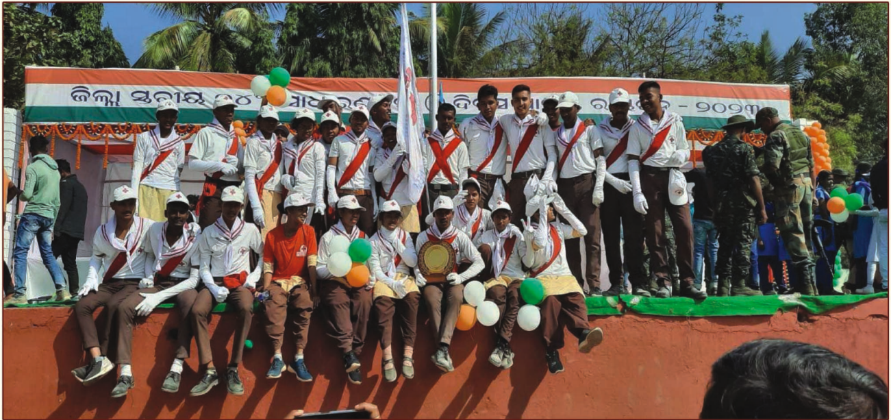
Rejoicing Youth Red Cross Volunteers after winning the Winners Trophy from the District Parade Ground of Republic Day 2023