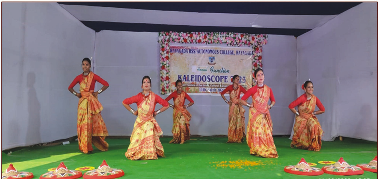
Students performing during Kaleidoscope of our college Annual Function 2023.