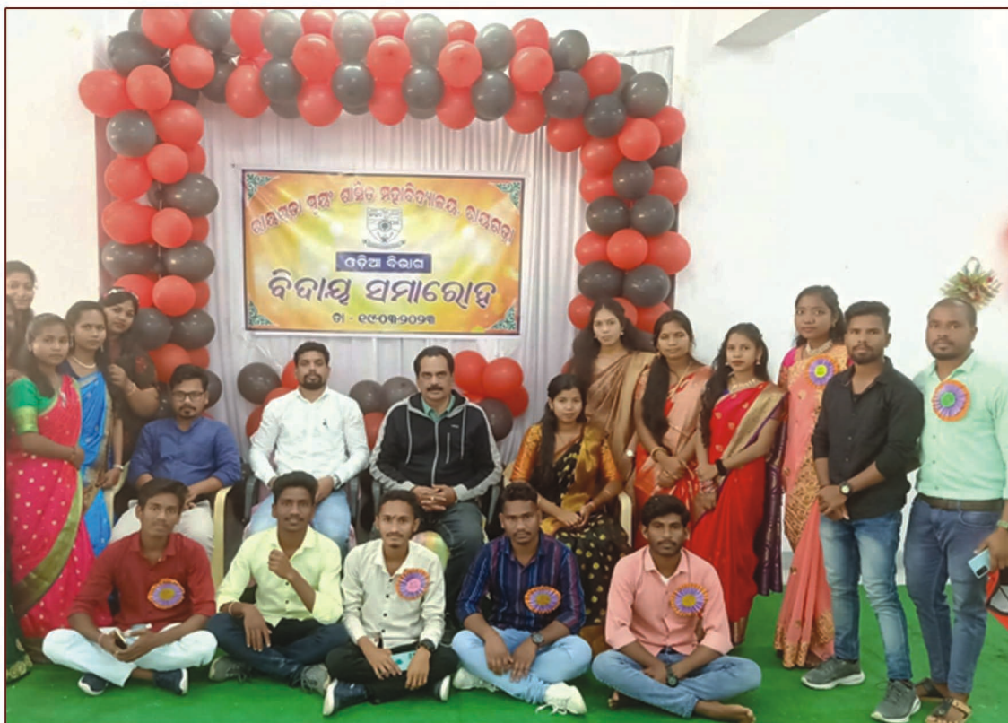
Principal, HoD and Staff posing for a group photograph during the Farewell Function of Odia Department held on 19.03.2023