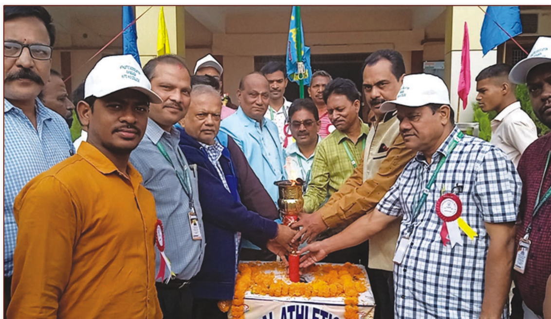
Principal, Guests, and members of the Athletic Association installing the Torch in the College Ground after invoking blessings from Maa Majhghariani.