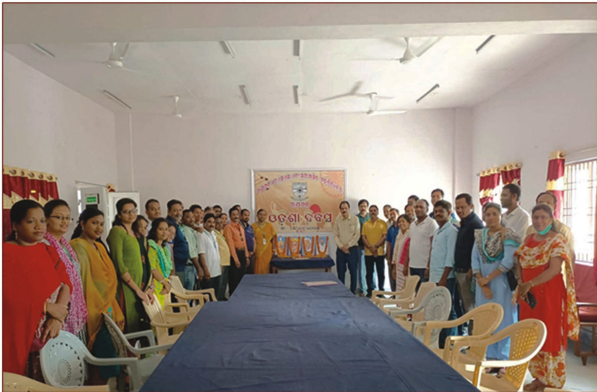
Principal and Staff garlanded the Heroes of Odisha and commemorated the sacrifices and great deeds for the formation of Odisha on the basis of its language during the 88th Odisha Divas Celebration in the College .