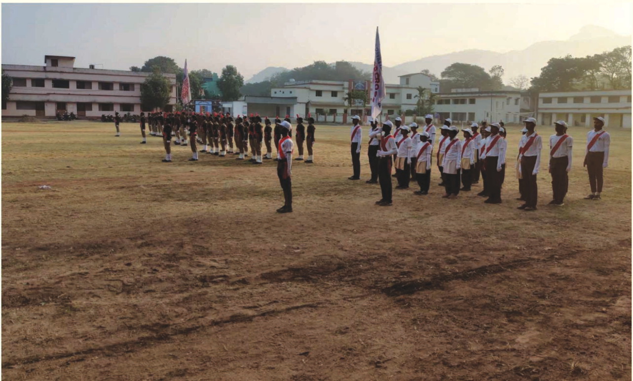
With shining glaze of 74th Republic Day morning NCC cadets and YRC Volunteers fallen in for Flag Hoisting in the College ground