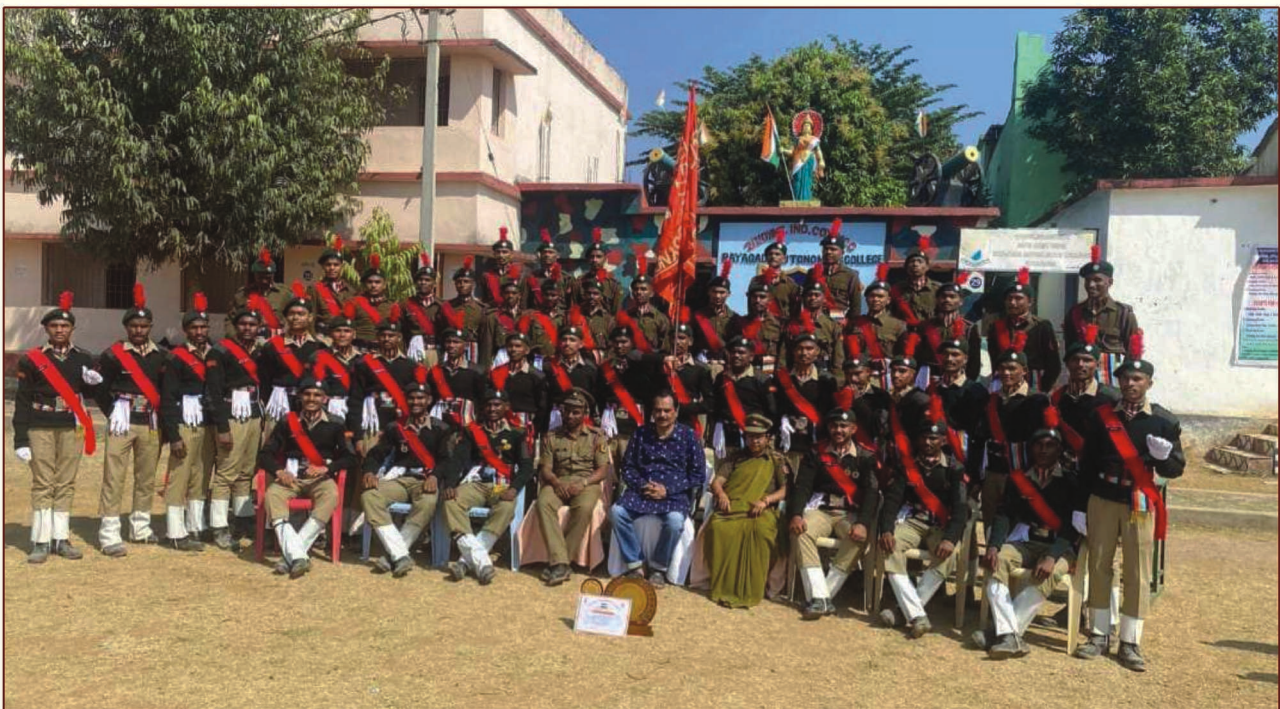
Best Paraders of District Parade of Republic Day 2023 posing with Principal and NCC Officers with their trophy.