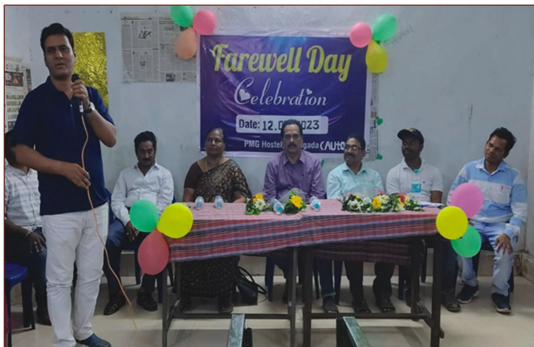
Principal, PMG & Nagabali Hostel Superintendents and the Committee members of the Hostel addressing students in a Farewell Function organized by the boarders .