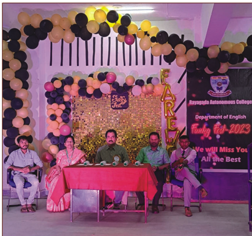
Principal, HoD, Staff and students during the Funky Feast, farewell function i.e 07.04.2023 for the PG and UG students of English Department.