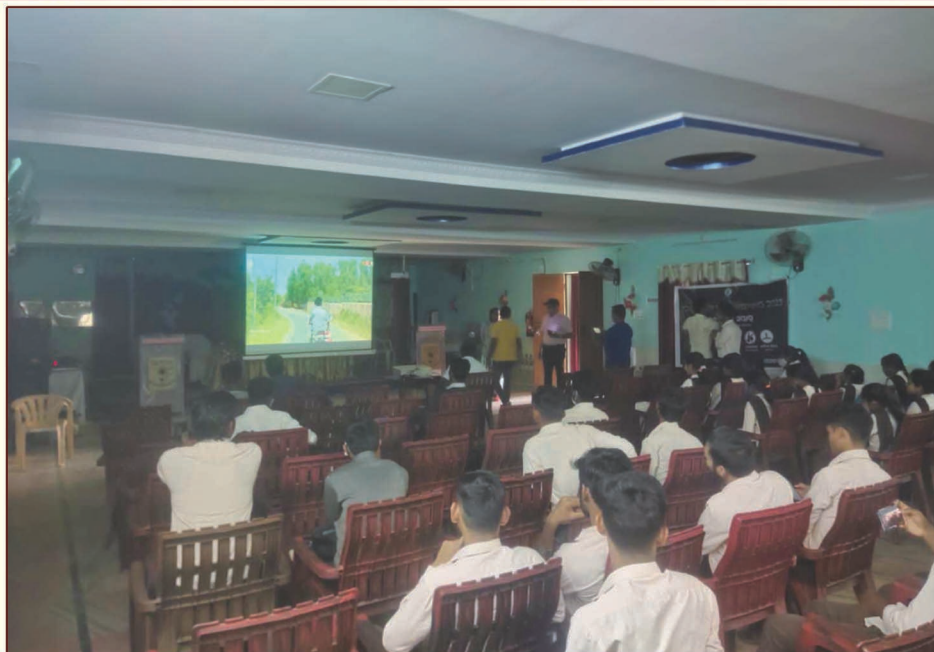
NSS Volunteers engrossed in a session during the Observation of the Road Safety Week held in collaboration with Regional Transport Office Rayagada on Dt.13.01.2023 in the Conference Hall of the College.