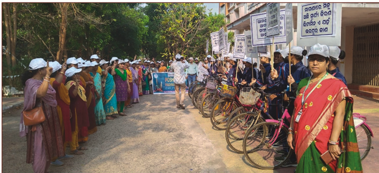
NCC Girls Cadets participated in a Cycle Rally during an awareness campaign of Poshan Pakhwada organized by Social Welfare Office, Rayagada on 29th March 2023