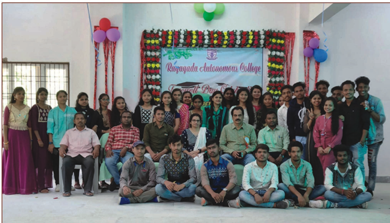
Principal, HoD and Staff posing for a group photograph during the Farewell Function of Botany Department on 07.04.2023