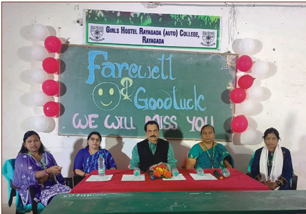
Principal, UGC Girls' Hostel Superintendent and the Committee members of the Hostel in a Farewell Function organized by the boarders on 18.03.2023