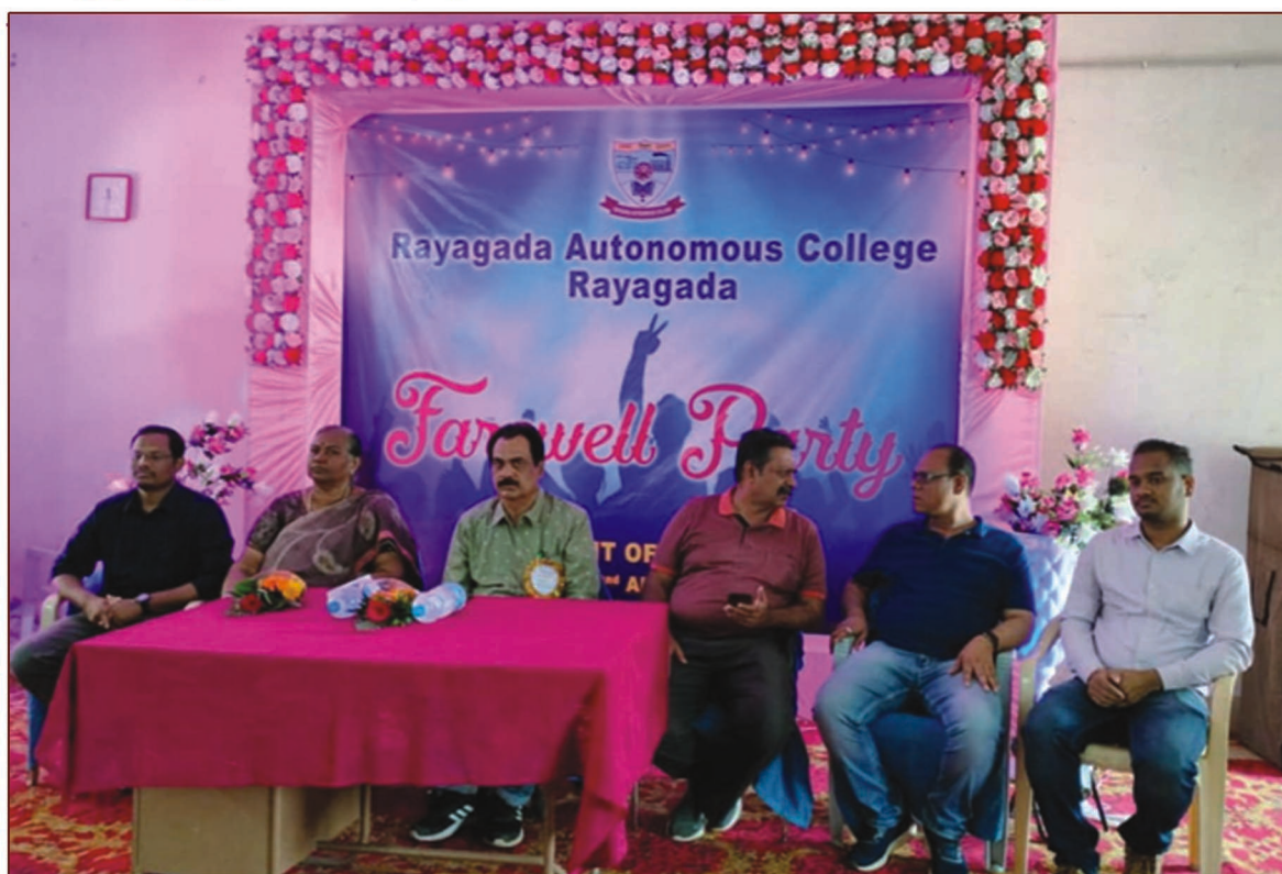
Principal, HoD and Staff posing for a group photograph during the Farewell Function i.e 07.04.2023 for the PG and UG students of Economics Department.