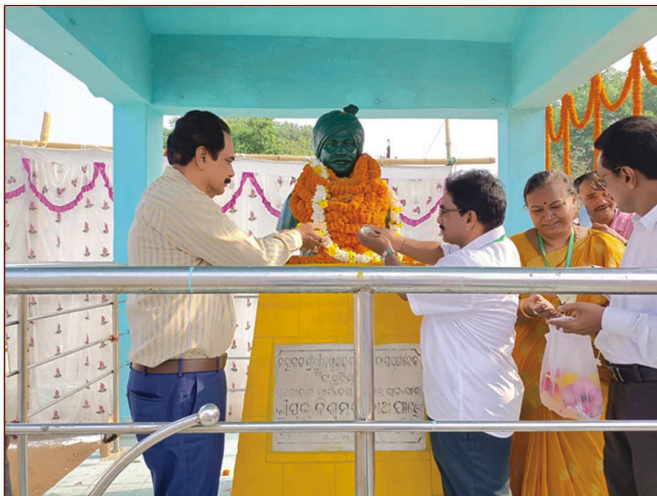
Principal and Staff participated in the District Level Odisha Divas Celebration and garlanded Maharaja Sri Krishna Chandra Gajapati Dev.