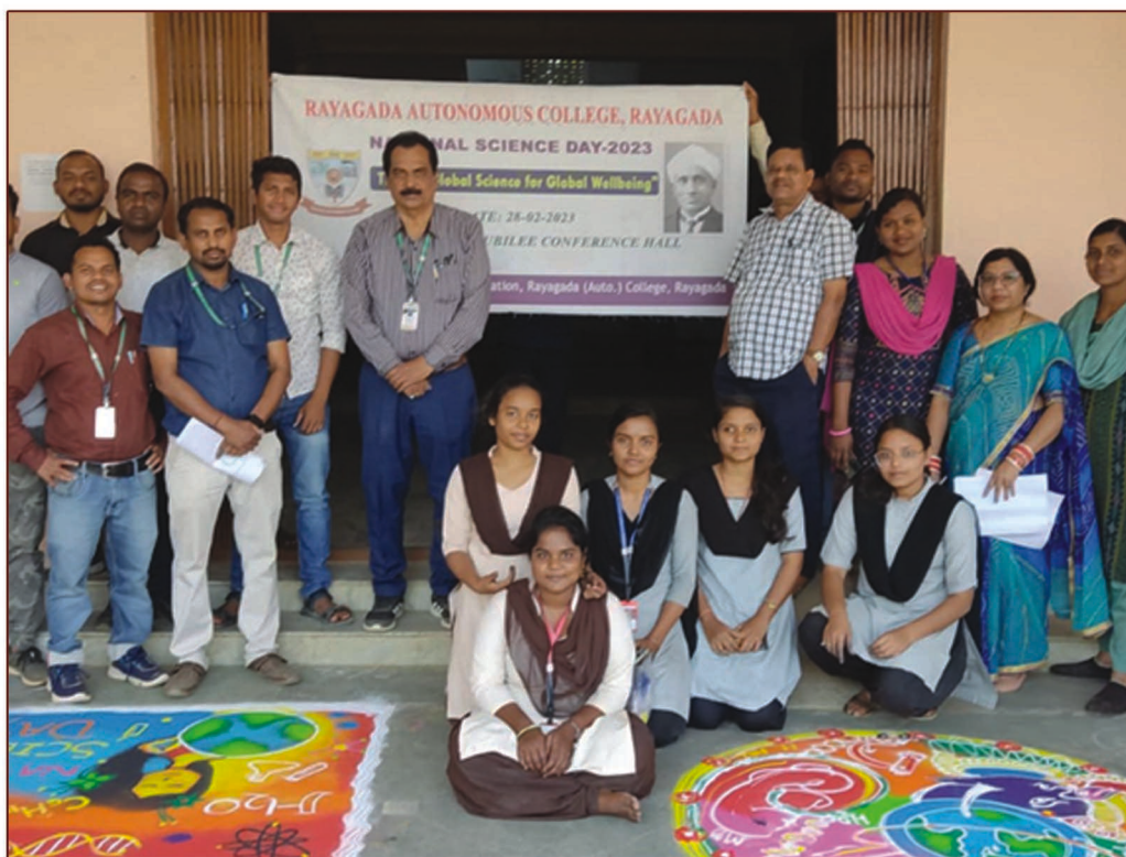
Principal and Faculty members of Science Departments posing during Rangoli Competition on National Science Day 2023.