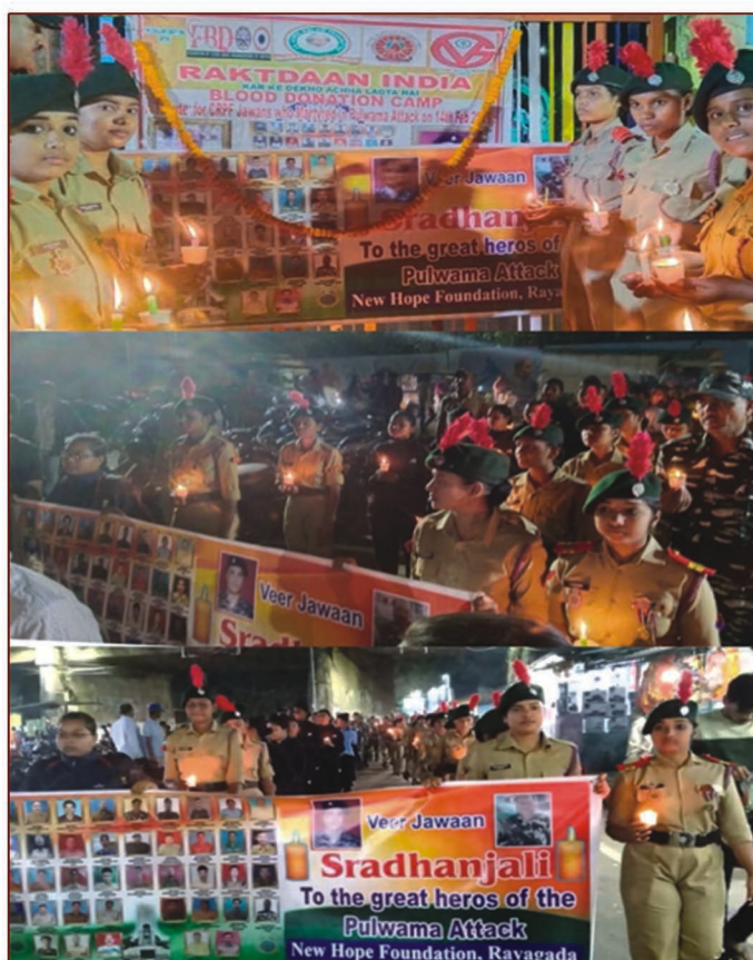
NCC Cadets of the college during a Candle Rally organised by the New Hope Foundation, Rayagada to commemorate the greatest sacrifices of the martyrs of Pulwama Attack on February 14, 2023.