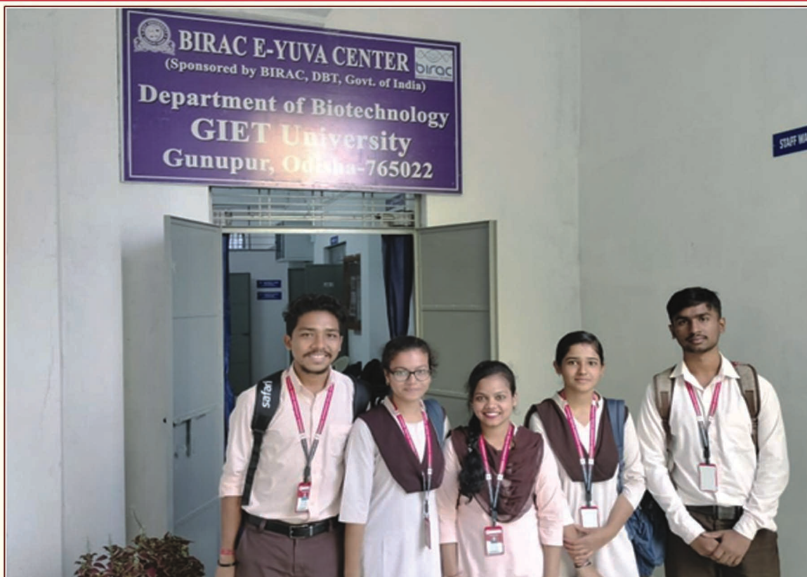
Students of Botany Department presented their Project on Topic "Natural Colorants: Extraction and Application" in BIRAC E-YUVA Center GIET University, Gunupur on 16/01/2023