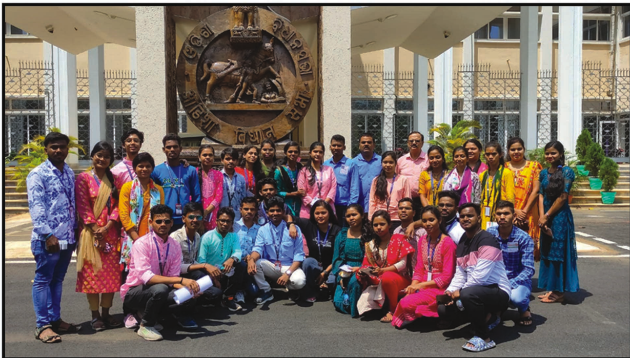
P. G Department of Political Science visited and witnessed a session in State Legislative Assembly and interacted with officials in Bhubaneswar on 21.03.2023.