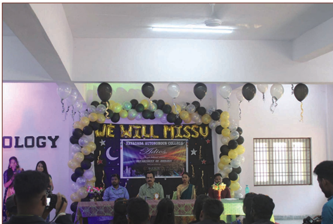
Principal, HoD, Staff and students during the Farewell Function of Zoology Department held on 07.04.2023