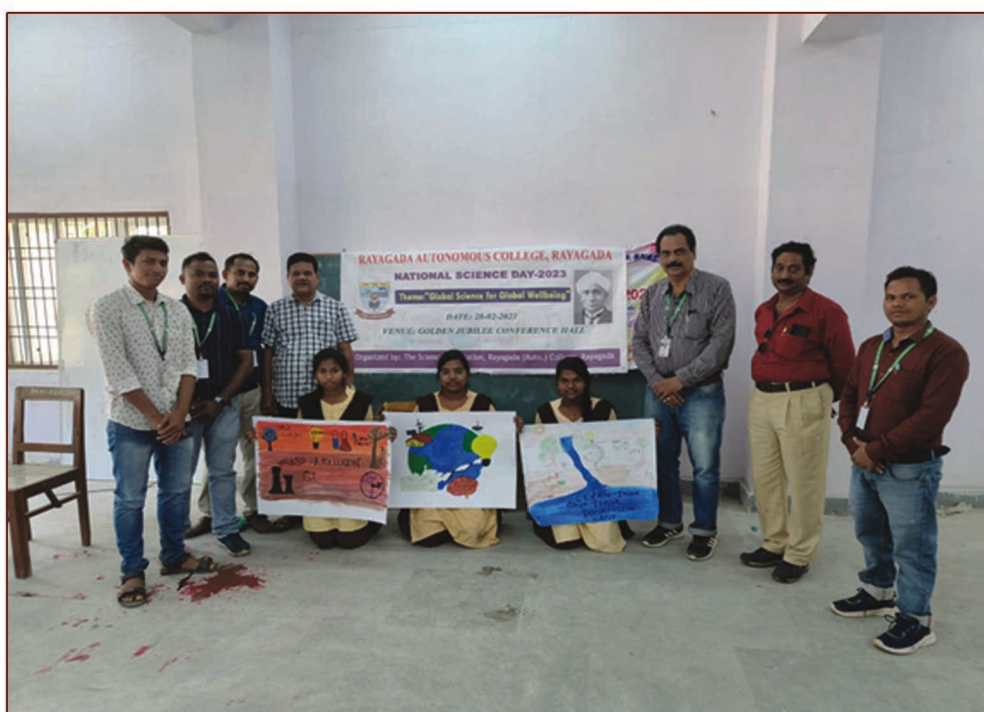
Principal and faculty members of the Science Departments along with students during a Painting competition on National Science Day 2023.