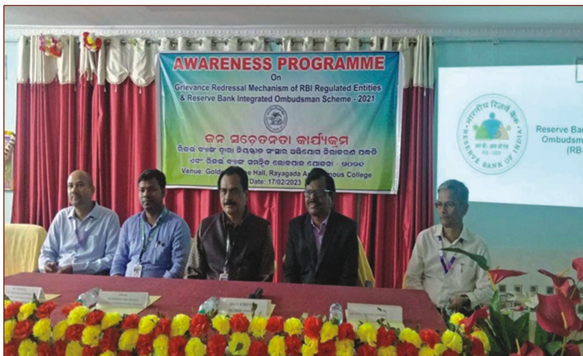
Principal and RBI officials during an awareness programme on Grievance Redressal Mechanism of RBI regulated entities and Reserve Bank Integrated Ombudsman Scheme organized on 17.02.2023