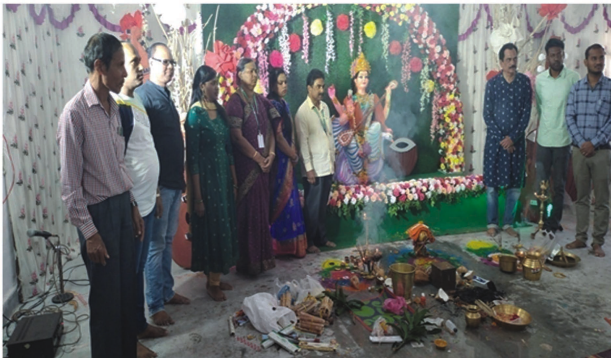
Principal and Committee members posing during Saraswati Puja 2023 held in the newly constructed Academic Building.