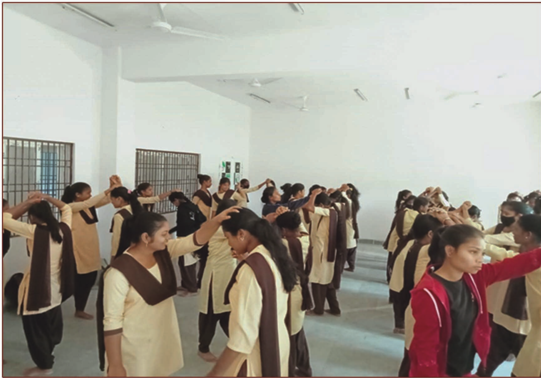
During a session of Self-Defence Programme, girls are in action, held during in 02/02/2023 to 10/02/2023 and 270 girls students participated.