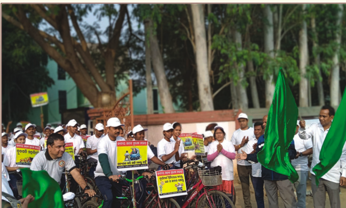
Students of the College participating in a Cycle Rally on National Road Safety Week 2023 which is being inaugurated by Hon'ble Minister Shri Jagannath Saraka.