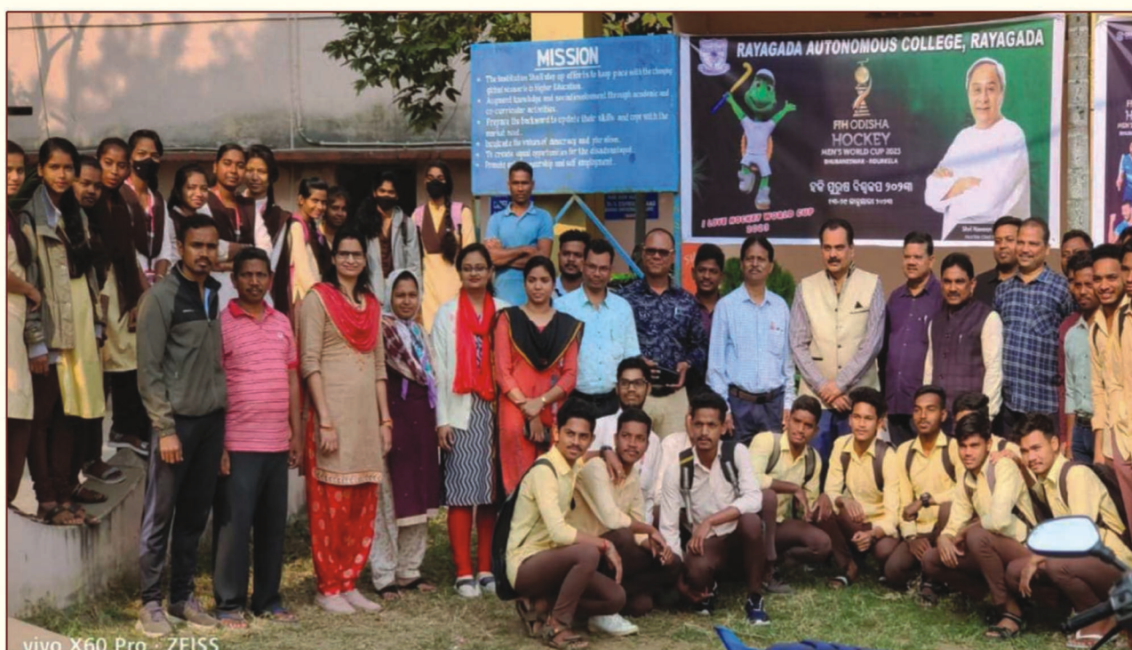
Principal, members of Athletic Association, Staff and Students were in pose in College Campus during the broadcast of FIH Men's Hockey World Cup 2023