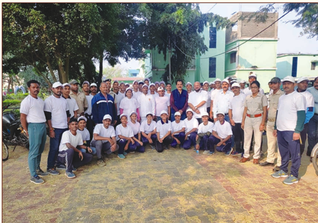
Principal, RTO, District Officials along with NCC Officers and Cadets participated in District Level Road Safety Awareness Week 2023.