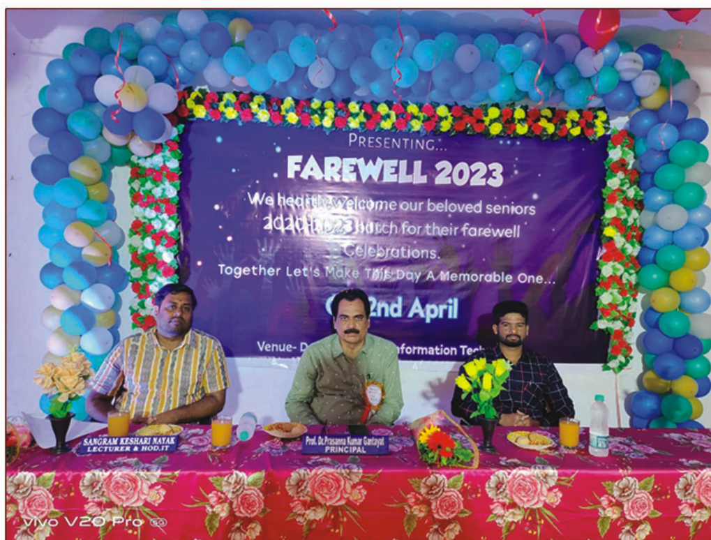
Principal, HoD, Staff and students during the Farewell Function of IT Department held on 07.04.2023